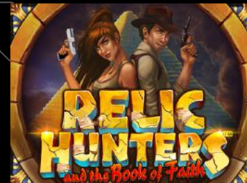
Relic Hunters and the Book of Faith™