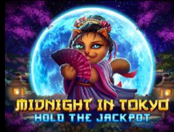
Midnight in Tokyo