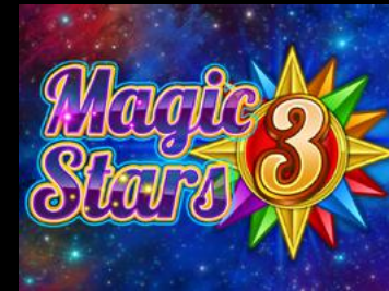
Magic Stars 3