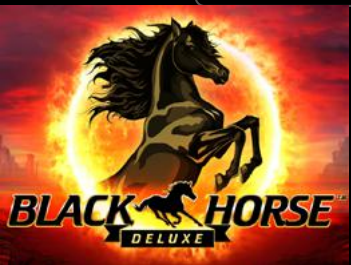
Black Horse™ Deluxe