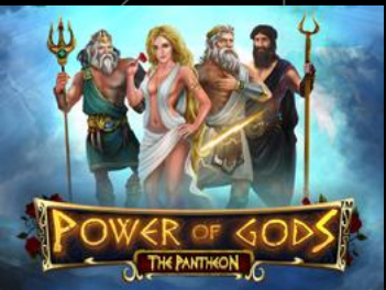
Power of Gods™: the Pantheon