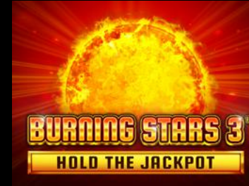
Burning Stars 3™