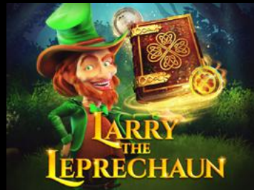
Larry the Leprechaun