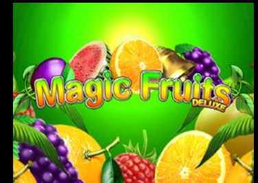
Magic Fruits Deluxe