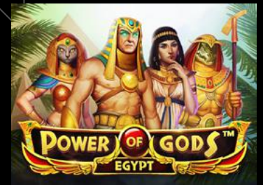
Power of Gods™: Egypt