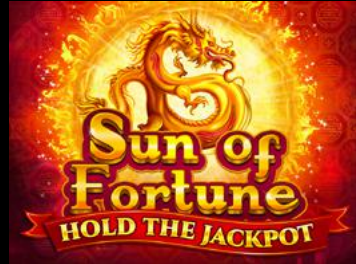
Sun of Fortune