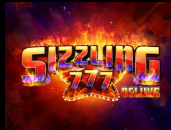
Sizzling 777 Deluxe